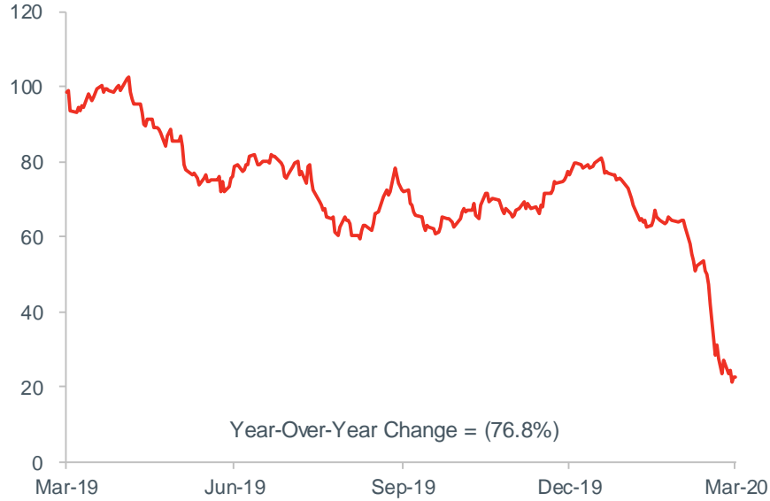
OSX Index - Last 12 Months through 3/20/2020